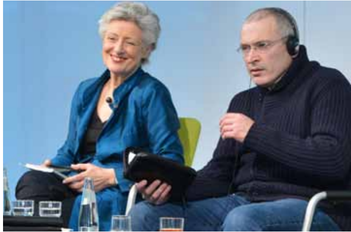
Marieluise Beck and Mikhail Khodorkovsky