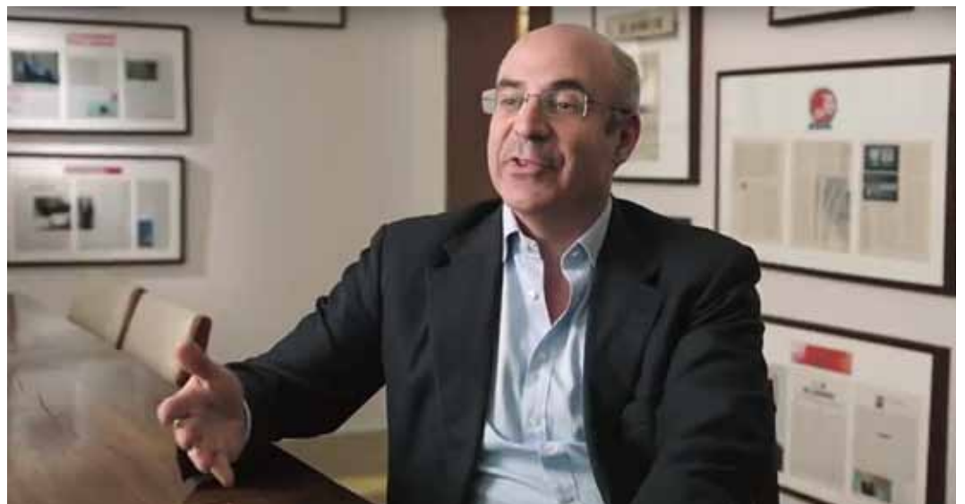
Bill Browder (Screenshot from the documentation trailer)

We tried to answer these questions in a film. We have concluded that the Browder case reflects today’s transformation of society in an essential way. That’s what our film is about. But so far it has