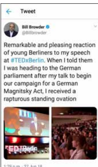
Twitter tweet on June 27, 2018 [3]

Bill Browder told his story to Andrei Nekrasov for the first time in an interview in 2010. Andrei wanted to make a film about it. The focus of the story was to be Sergei Magnitsky, Browder’s lawyer, as Andrei believed at the time.