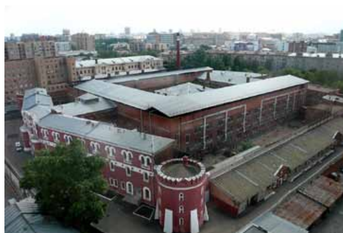
11] Butyrka: Remand Prison Number 2 in Moscow, where Magnitsky was imprisoned.

Unfortunately, it is still often the case in Russia that people are put behind bars for questionable reasons, and numerous hu-