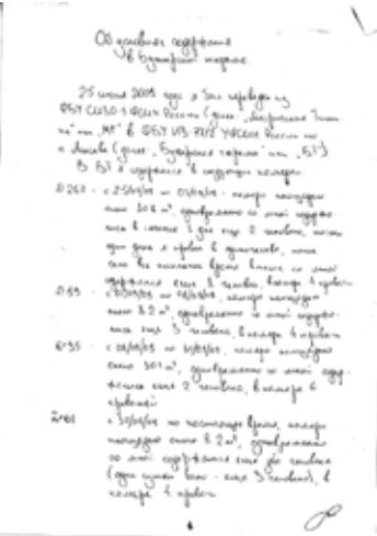
[12] „Magnitsky’s Diaries“, here a screenshot from page 1 of the PDF file

Magnitsky’s arrest and one-and-a-half years after his first alleged exposing testimony, Hermitage Capital posted a professionally produced video[20] about a $230 million tax theft on YouTube. The arrest of a „lawyer and accountant“ is only briefly mentioned at the very end, not a word about the torture, nor anything about Magnitsky’s alleged heroic exposing of the tax theft.