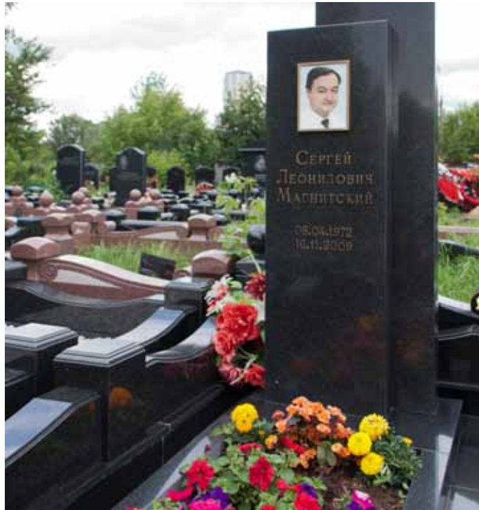
Magnitsky’s grave at the Preobrazhensky cemetery

It is quite astonishing that the Parliamentary Assembly of the Council of Europe, evidently marked by prejudice and arrogance, accepts such incompetence and, what is worse, acts under the undue influence of a powerful