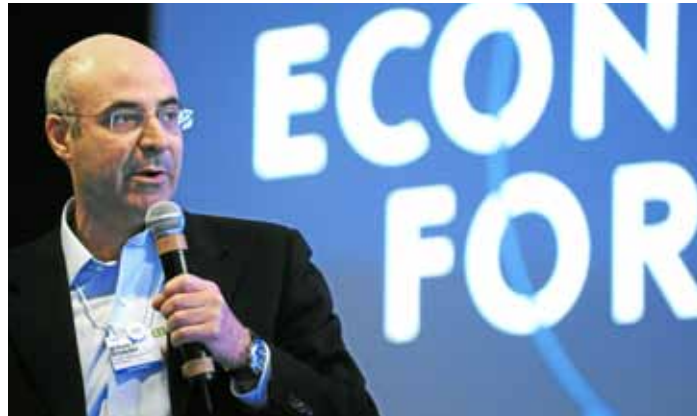
DAVOS/SWITZERLAND, 27JAN11 - William F. Browder, Chief Executive Officer of Hermitage Capital Management, asks questions during the session „Russia's Next Steps to Modernization' at the Annual Meeting 2011 of the World Economic Forum in Davos, Switzerland, January 27, 2011.