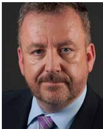
Bernd Fabritius, German politician (Photo: Gerd Seidel / License: Creative Commons CC-by-sa-3.0 de)

After the cancellation of the film’s premiere at the European Parliament on 27 April 2016 and the film’s withdrawal by the ARTE on 3 May 2016, Bill Browder published two press releases. One was on 9 May 2016[23] alleging the “French channel ARTE” had officially informed Browder that it is cancelling the „anti-Magnitsky propaganda film” and had “no intention to show it at any point in the future”. The second press re-